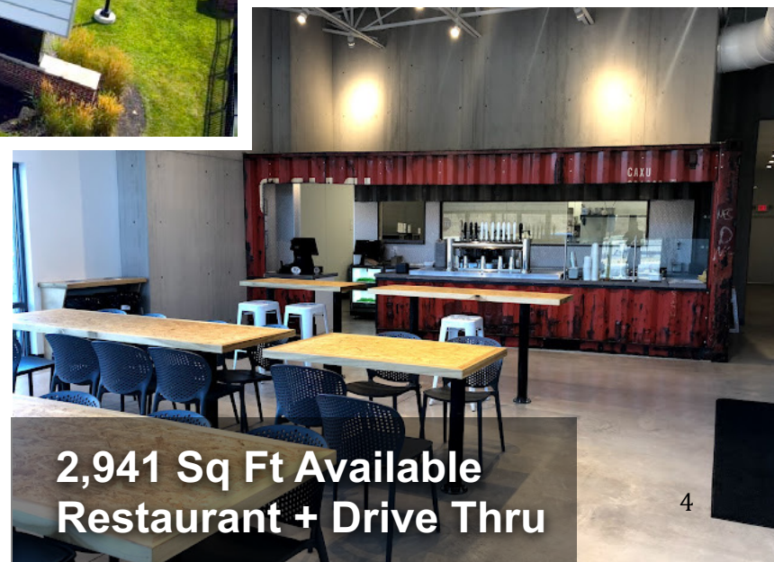
2,941 Sq Ft Available Restaurant + Drive Thru