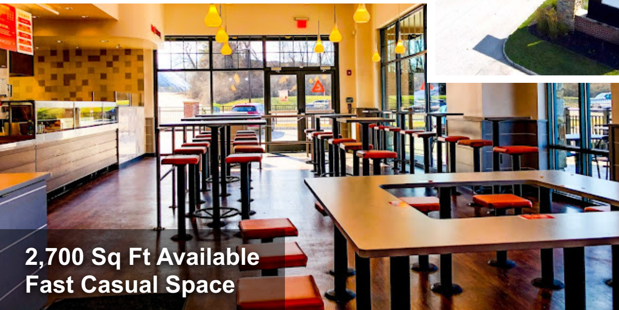
2,700 Sq Ft Available Fast Casual Space